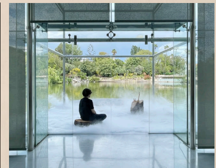
KYOSHITSU SHOHAU – An Empty Room Turns White For Enlightenment 虚室・生白 Left: Season Lao: Natural Emptiness 자연 여백 Joong Jung Gallery (Seoul) | 2/8 – 27/9/2025 Right: Season Lao : Une pièce vide vient blanche pour l'illumination | 13/5– 25/11/2023 Musée des arts asiatiques (Asian Art Museum in Nice, France, architecture by Kenzō Tange)